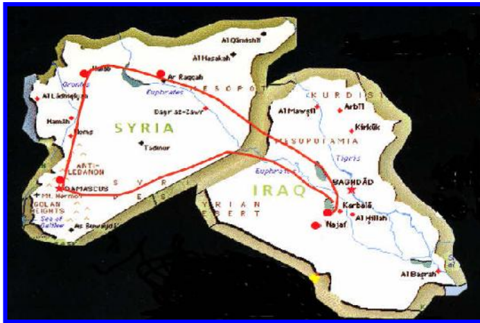
Map showing Route taken from Karbala to Damascus

Let's learn about Bibi Zainab(AS) and Bibi Kulthoom(AS)