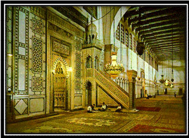
The mimber in the Darbar e Yazeed, Masjid e Ummaya

Bibi Zainab (AS) angrily shouted, "How dare you! Have you lost all sense of shame that you want to make the grandchild of the Prophet a slave!"