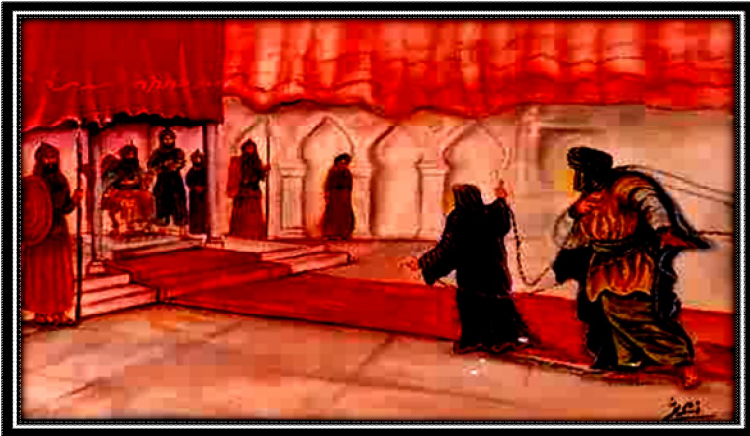
The fourth Imam being brought in chains to the court of Ibn Ziyad

orphan was four-year-old Sakina , the sweet daughter of Hussain .