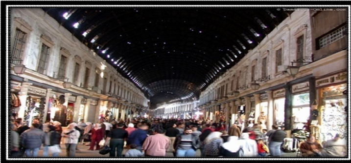
The Bazaar with the balconies in the Souk e Hamidiyya, Damascus.

In the covered bazaar, there were balconies from where the women of Shaam watched the procession go by. They started throwing dates, sadqa (alms), on the family of the Prophet. Bibi Zainab cried " Sakina , I know you are very hungry but don't touch the dates. Bibi Kulsoom (AS) turned to the women and said "Don't you know we are the family of the Prophet. Sadqa is haraam for us.