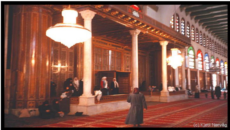
Darbaar-e-Yazeed, Masjid Ummaye

The Darbaar of Yazeed had ambassadors from other countries, leading citizens and more than seven hundred important men, sitting in their finery.