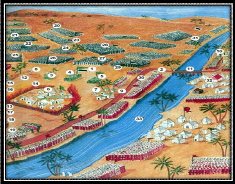
Battlefield of Karbala